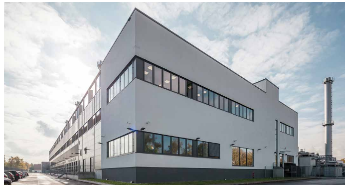
Equinix FR2 IBX data center exterior

The Equinix metro International Business Exchange™ (IBX®) data centers consist of six IBX data center facilities (and two further xScale buildings) with 60,350+ square meters (649,500+ square feet) of colocation space. Each of our Frankfurt facilities is compliant with key international standards including ISO 9001: 2008 for quality management systems and ISO 27001 for information security management systems.