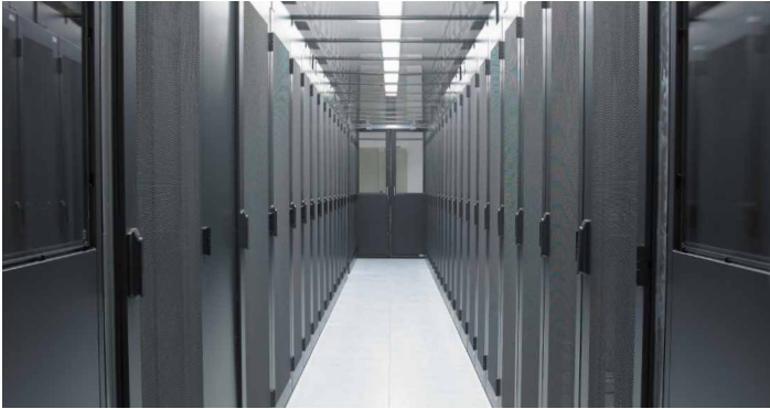
Equinix FR2 IBX data center interior